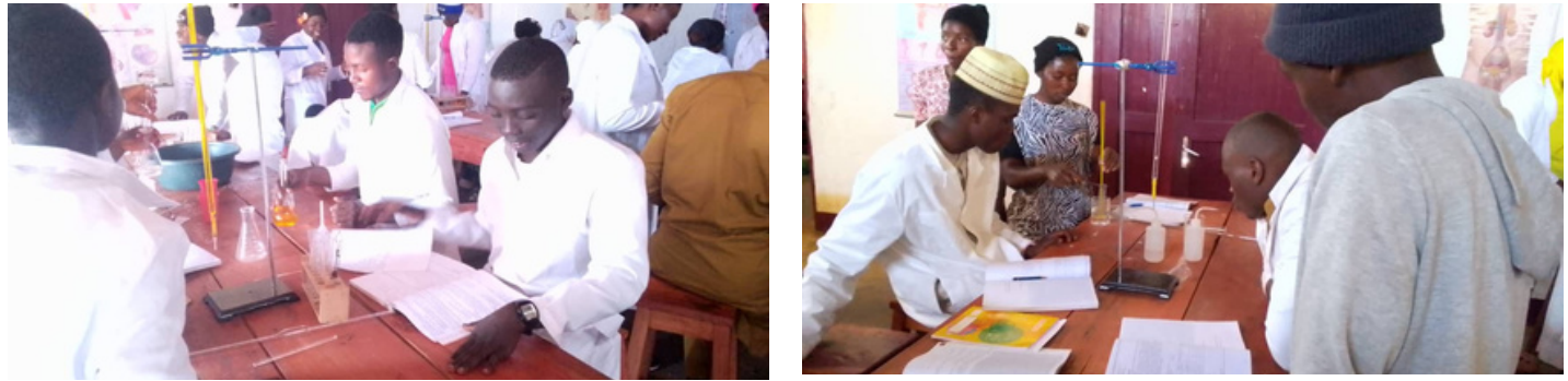
Science students in Kumbo making use of the Lab

The Kumbo Public Science Laboratory, a joint project by SHUMAS and Citibank, continues to offer practical science education in biology, chemistry, and physics to students in Bui Division. In March, ICT training using the solar energy was provided to 11 youths, and six traumatized students received psychosocial support, fostering both academic and emotional development amid the ongoing crisis.