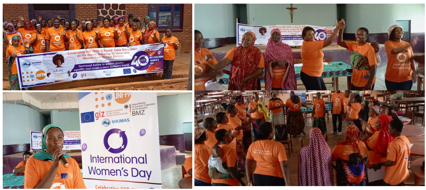
Community Nurses trained and deployed to serve in their communities

In alignment with the 2025 International Women's Day theme, "For ALL Women and Girls: Rights. Equality. Empowerment," the United Nations Population Fund (UNFPA) and SHUMAS organized a roundtable discussion in Bamenda. Over 50 women from four social and cultural groups participated, gaining valuable insights into women's rights, empowerment, and gender-based violence. Testimonies from beneficiaries highlighted SHUMAS' ongoing contributions to women's empowerment and the fight against GBV. In attendance was a representative of the North West Regional Délégation of Women's Empowerment.