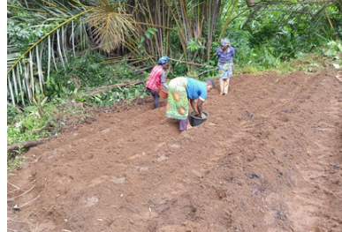
Land preparation in Kumbo