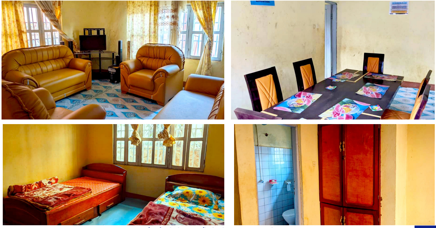
SHUMAS' Safe Shelter at Mile 6, Nkwen - Bamenda

Gender-based violence (GBV) is a pervasive and devastating issue that affects individuals, families, and communities worldwide. In Cameroon, SHUMAS' Safe Shelter is providing a beacon of hope for survivors of GBV and SEA, offering a confidential, inclusive, and supportive sanctuary for those seeking refuge.