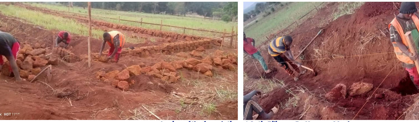
Laying of the foundation at Cetic Bilingue De Koupa - Menke

SHUMAS and Building Schools for Africa are addressing infrastructure challenges at CETIC Bilingue de Koupa-Menke in Cameroon's West Region, which serves 164 students, including 89 internally displaced persons. The ongoing project includes the construction of three classrooms, an office, a store, and the provision of essential furniture to enhance the learning environment. As of March, a protocol agreement has been signed, and foundational work has commenced