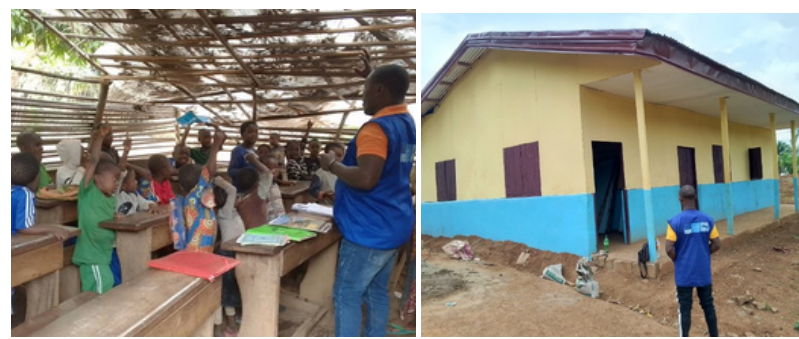
Monitoring of TLS' in the North West Region

Throughout March, SHUMAS played a crucial role in monitoring the UNICEF-ECHO II project in Northwest Cameroon, which addresses the humanitarian needs of children impacted by the ongoing crisis. Focus areas include education, water, sanitation, hygiene, and child protection. SHUMAS collaborated with five implementing partners to oversee 53 temporary learning spaces across six divisions. Field visits conducted in Menchum, Mezam, Bui and Ngoketunjia Temporary Learning Spaces in March led to recommendations and corrective actions to maintain the project's efficiency.